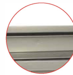
B: RUBBER STRIPS INCLUDED TO MINIMIZE VIBRAION