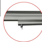
A: MOUNTING PIN DESIGNED TO FIX THE WIDTH AND STABILIZE THE BASE