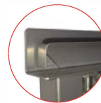
C: FILTER RACK WITH STOPPER TO FIX FILTERS WELL